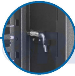
L Tower Bolt Lock Inside