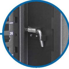
L Tower Bolt Lock Inside