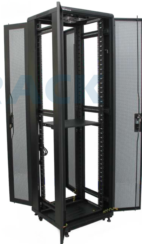
Open Side View

Optional cable entry on top cover and bottom panel. Front door, rear door and side panel can be removed facility, the bottom has the function of ventilation and rat-proof. Varies optional accessories, reliable quality.