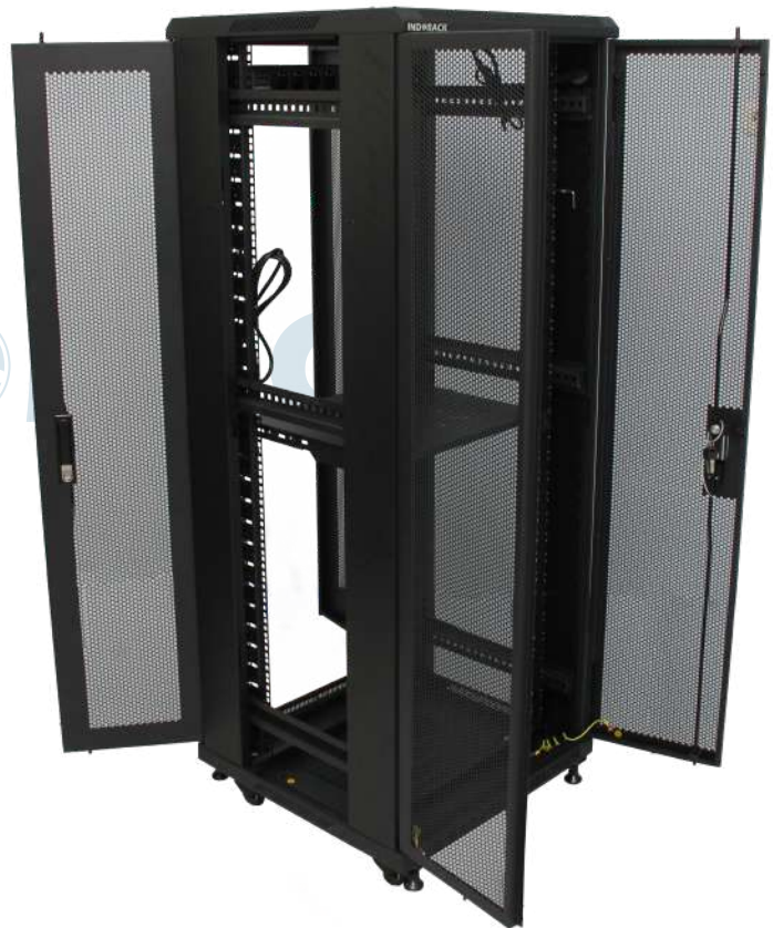
Open Side View

Optional cable entry on top cover and bottom panel. Front door, rear door and side panel can be removed facility, the bottom has the function of ventilation and rat-proof. Varies optional accessories, reliable quality.