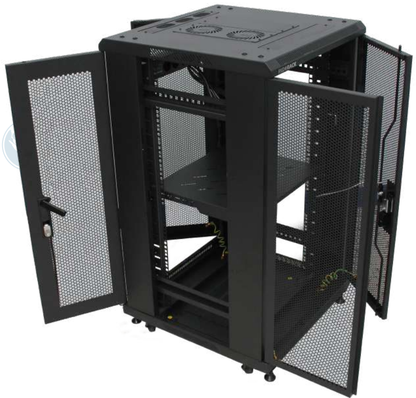
Open Side View

Optional cable entry on top cover and bottom panel. Front door, rear door and side panel can be removed facility, the bottom has the function of ventilation and rat-proof. Varies optional accessories, reliable quality.